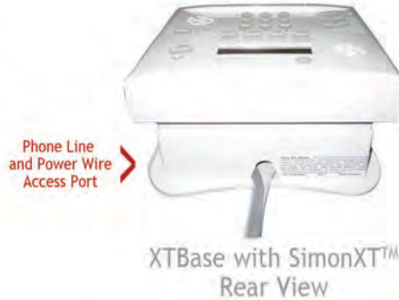
XTBase with SimonXT™ Rear View