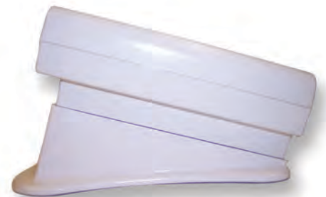
XTBase with SimonXT™ Side View

© 2011 XT Plastics, LLC. All rights reserved. All trademarks are the property of XT Plastics, LLC. and its subsidiaries.