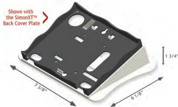
Shown with the SimonXT™ Back Cover Plate