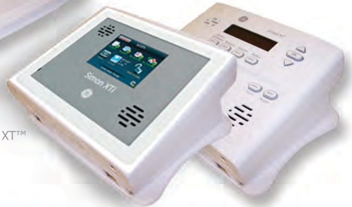
XTBase with Simon XT™ and Simon XTi™ Right Side View

Desktop Mount base that allows you to place your Simon XT™, Simon XTi™, Simon XT5™ or alarm system keypad conveniently on a night stand or end table or counter, instead of being wall mounted. Incredibly easy to install, just snaps right into place.